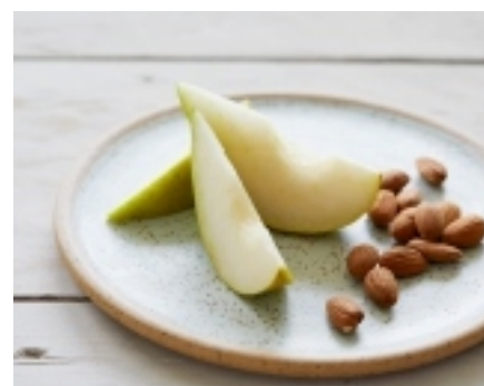
USA Pears Handling