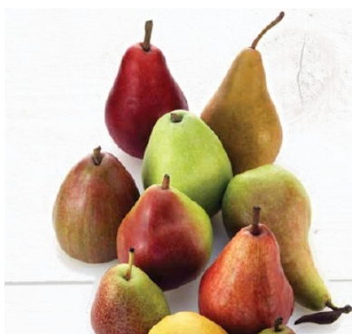
The Many Varieties of Pears

Click the resources below to learn more about pears!