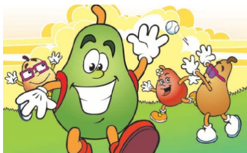
Pear Activity Sheet