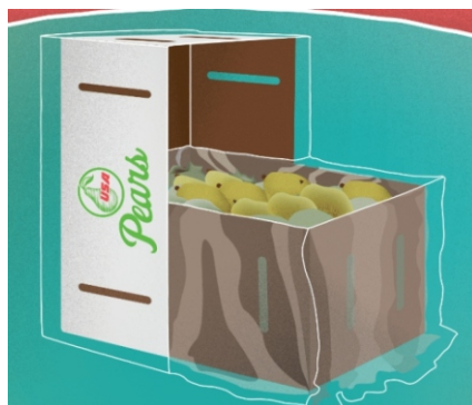
Pear-fect Guide to Ripe Pears