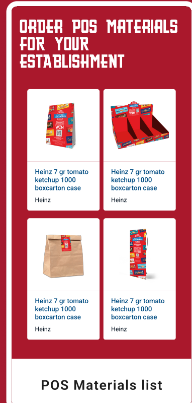
POS Materials list