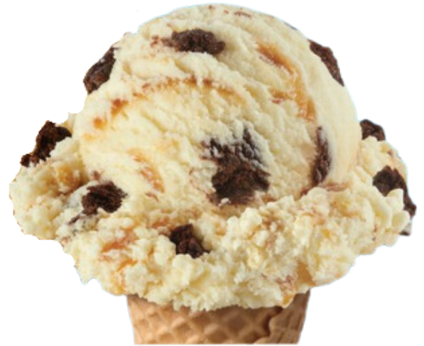
#108301 • 3 gal Monkey Business Banana flavored ice cream with brownie chunks and caramel swirls