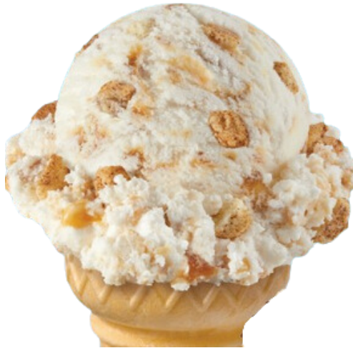
#108302 • 3 gal Churro Chata Cinnamon flavored ice cream with churro pieces and caramel swirls