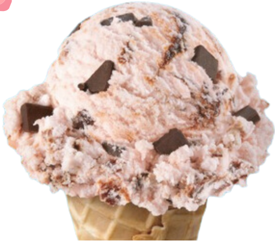
#108300 • 3 gal Chocolate Covered Strawberry Strawberry flavored ice cream with chocolate chunks and chocolate fudge swirls