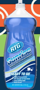
#103127 ♦ 6/38 oz Intercon Sunrise Manual Pot & Pan Detergent

This highly effective concentrated premium hand dish detergent produces rich "grease eating" suds that quickly cut through food soils. Contains special suspending agents to keep grease and soils from redepositing on dishes, as well as lanolin to leave hands soft. This specialized surfactant blend is equally effective on a variety of other washable surfaces.