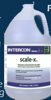
#89051 ♦ 4/1 gal Intercon Premium Delimer Scale X

This concentrated delimer is low odored and non-fuming, preventing corrosion while dissolving lime deposits, scale, milkstone, films and light rust from stainless steel, aluminum, tile, porcelain and other surfaces. Can be diluted for manual cleaning or up to full strength for fast deliming of automatic dishmachines and C.I.P. equipment.