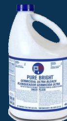
#87920 ♦ 6/1 gal Champion Pure Brite Bleach

The Stainless Steel Cleaner & Polish is a high-gloss formula cleaner and polish that maintains a bright, clean finish on stainless equipment in kitchens, laboratories, offices, restaurants and other institutional applications. This labor saving "one-step" product shines as it cleans, leaving a soil resistant coating that makes future clean-ups an easy task.