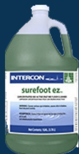
#88089 ♦ 2/1 gal Intercon Surefoot Enzyme Floor Cleaner This new generation foaming cleaner and degreaser is specifically designed for use on quarry tile floors. Utilizing the latest cleaning technology, SUREFOOT EZTM employs bioactive enzymes to digest oils and food soils without the use of harsh caustic chemicals. Its powerful surfactants and builders help penetrate the pores in quarry tile, terrazzo, marble and grout, carrying the bioactive enzymes along to accelerate cleaning. As the bioactive enzymes digest food soils, they reduce odor caused by decay and reduce slippage.

This blend of builders, surfactants, water softening agents and optical brighteners make this an effective and economical powdered detergent to use. Its non-phosphate formula has been designed for compliance with environmental regulations to reduce phosphates in waste water. This free-flowing, easily dispersible formula produces exceptional results in all water conditions and is safe for all fabric types. Compatible with other laundry aids.