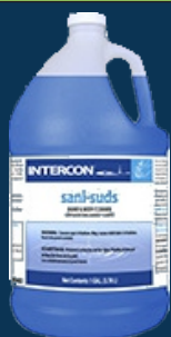
#88268 ♦ 4/1 gal Intercon Sani-Suds Antibacterial Soap Providing state-of-the-art cleaning and protection for the entire body (including hair), this product contains an exclusive blend of cosmetic-grade surfactants which offer effective yet gentle cleaning. It also contains emollients that leaves skin soft.