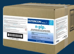
#89495 ♦ 25 lb Intercon Powdered All Temperature Laundry Detergent

This blend of builders, surfactants, water softening agents and optical brighteners make this an effective and economical powdered detergent to use. Its non-phosphate formula has been designed for compliance with environmental regulations to reduce phosphates in waste water. This free-flowing, easily dispersible formula produces exceptional results in all water conditions and is safe for all fabric types. Compatible with other laundry aids.