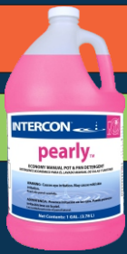
#88235 ♦ 4/1 gal Intercon Pearly Pot and Pan Detergent, Value

This effective concentrated economy hand dish detergent produces rich suds that quickly cut through food soils. Combining a great floral scent with special suspending agents, it keeps grease and soils from redepositing on dishes.