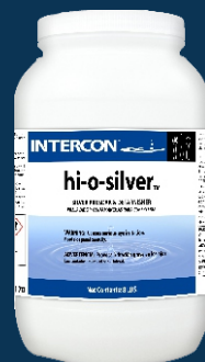
#89032 ♦ 2/8# Intercon Hi-o-silver Powder Presoak

Specially formulated for presoaking and detarnishing of flatware, this product performs equally well in hard or soft water. Contains ingredients which aid in the reduction of water spotting on flatware, as well as loosening cooked-on soils.