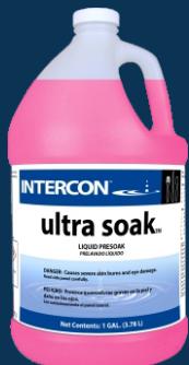
#89036 ♦ 2/1 gal Intercon Ultra Soak Liquid Presoak

This premium delimer is low odored and nonfuming. It prevents corrosion while dissolving lime deposits, scale, milkstone, films and light rust from stainless steel, aluminum, tile, porcelain and other surfaces. Can be diluted for manual cleaning or up to full strength for fast deliming of automatic dishmachines and C.I.P.