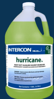
#88705 ♦ 4/1 gal Intercon Hurricane Concentrated Alkaline Degreaser

Powerful aerosol formula that dissolves carbon buildup on metal surfaces. Removes carbon from metal surfaces, stainless steel, nickel steel, deep fryers, pots & pans, stove parts, waffle bakers, brass, woks, popcorn kettles, sheet pans, broilers, grills, and more! Just spray surfaces with carbon buildup, let it sit, and then wipe away dissolved carbon with no scrubbing involved.