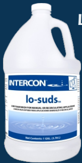
#88166 ♦ 2/1 gal Intercon Lo Suds Glass Detergent

This low foam glass wash detergent is formulated to provide superior cleaning, water sheeting and drying under the widest range of water temperatures, hardness, and soil conditions. Compatible with hypochlorite, quaternary and iodine sanitizers.