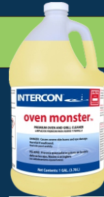
#88834 ♦ 2/1 gal Intercon Oven Grill Monster Cleaner

The Oven & Grill Cleaner is a powerful blend of detergents and surfactants that are effective in penetrating and emulsifying soils, food and grease. This products high foaming formula is meant to be used on ovens, grills, hoods, fryers, and more.