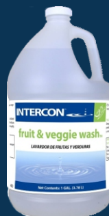
#89497 ♦ 2/1 gal Intercon Fruit & Veggie Wash Fruit and vegetable wash is an effective produce solution when dispensed into your produce sink at 1/4 oz./gal. Its cutting-edge formulation safely removes wax, soil and agricultural chemicals from produce. Natural, non-toxic, and effective, this product can remove unpleasant flavors and actually work to make food taste better.