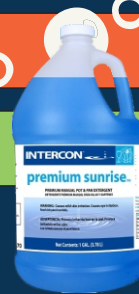
#89447 ♦ 4/1 gal Intercon Blue Premium Sunrise Dish Detergent

This highly effective, concentrated hand dish detergent combines a great springtime-fresh scent with rich "grease eating" suds that quickly cut through food soils. Contains special suspending agents to keep grease and soils from redepositing on dishes, as well as lanolin to leave hands soft. This specialized surfactant blend is equally effective on a variety of other washable surfaces.