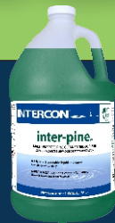
#88671 ♦ 2/1 gal Intercon Inter-Pine General Cleaner

The Citrus Degreaser is a citrus based degreaser that is best used for general cleaning and other hard surfaces. This formula will effectively remove grease, dirt, oils, and grime while leaving behind a pleasant citrus scent.