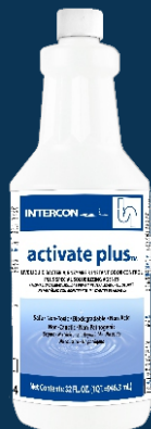
#89075 ♦ 12/32 oz Intercon Enzyme Activate Plus Liquid Drain Maintainer and Deodorizer

Pure Bright Professional Cleaning Products are specifically formulated for the tough cleaning needs of institutions and industrial cleaning settings, including clinics, hospitals, fitness clubs and restaurants. Latex Free.