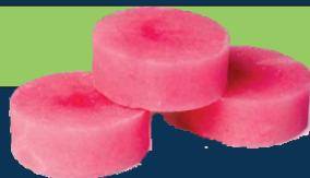
#88620 ♦ 12/4 oz Health Gards Urinal Blocks, Cherry Scented