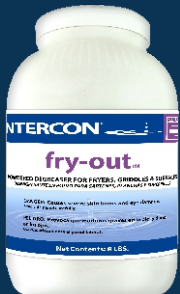
#87722 ♦ 2/8 lb Intercon Fry-Out Powdered Cleaner

This powerful oven and grill cleaner contains strong alkali, detergent builders and surfactants to penetrate, emulsify and saponify soil, food, grease and carbon deposits. Concentrated for strength and economy, this product is effective in removing light to very heavy accumulations of oils, grease, food and dirt that may be found in all food serving and processing areas.