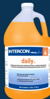
#88112 ♦ 4/1 gal Intercon Orange Neutral Daily Cleaner

This concentrated blend of live liquid bacteria and enzymes activate drain lines and grease traps while providing instant odor control. Exceptionally effective in controlling odors in garbage collection containers, porta-toilets, restrooms and other problem areas. In addition to its bioactive agents, this product contains a high concentration of grease solubilizers insuring superior performance by allowing faster penetration and liquefaction of waste materials.