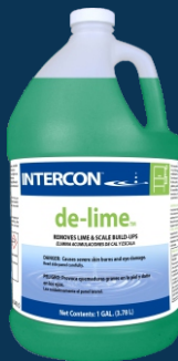
#89050 ♦ 4/1 gal Intercon Delimer

This low foam glass wash detergent is formulated to provide superior cleaning, water sheeting and drying under the widest range of water temperatures, hardness, and soil conditions. Compatible with hypochlorite, quaternary and iodine sanitizers.