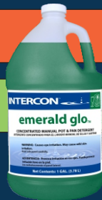
#89448 ♦ 4/1 gal Intercon Emerald Glo Dish Detergent, Budget

This effective concentrated economy hand dish detergent produces rich suds that quickly cut through food soils. Combining a great floral scent with special suspending agents, it keeps grease and soils from redepositing on dishes.