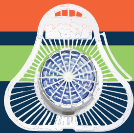
#88625 ♦ 1 ct Tolco Urinal Block with Screen Deodorizer