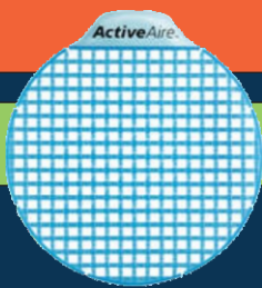
#88626 ♦ 12 ct ActiveAir Urinal Deodorizer Screens, Low-Splash