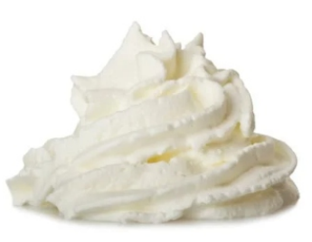
#106555 • 12/15 oz Whipped Cream Light Aerosol